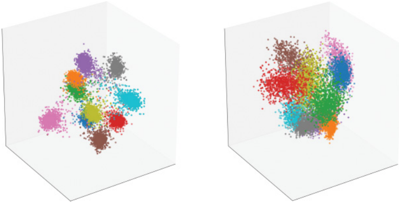
Figure 4: Visualizing the data representation of the MNIST test set in the last hidden layer of kLeNet-5 (left) and LeNet-5 (right). Each color corresponds to a digit. Representations learned by kLeNet-5 are more discriminative for different digits.

Note: The kernelized model (kLeNet-5) was trained layer-wise.