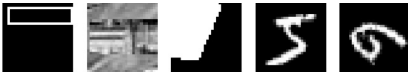
Figure 2: From left to right: example from rectangles , rectangles-image , convex , mnist (50k test) and mnist (50k test) rotated.

underlying optimization algorithm. We show that this algorithm, albeit only having been certified under certain families of objectives, works well with most popular objective functions in practice. We then compare kMLPs trained with BP and the layer-wise algorithm to show the effectiveness of the latter. Finally, to showcase the competence of the greedily trained kernelized models, we compare kMLPs learned layer-wise with other popular deep architectures including MLPs, deep belief networks (DBNs; Hinton & Salakhutdinov, 2006), and stacked autoencoders (SAEs; Vincent, Larochelle, Lajoie, Bengio, & Manzagol, 2010), with the last two trained using a combination of unsupervised greedy pretraining and standard BP (Hinton et al., 2006; Bengio et al., 2007). We also visualize the learning dynamics of greedy kMLPs and show that it is intuitive and simple to interpret. In the second part of the experiments, we partially kernelize the classic LeNet-5 (LeCun, Bottou, Bengio, & Haffner, 1998) and compare it with the original to validate our claim that the proposed kernelization and training algorithm is flexible in the sense that it works well with any given feedforward NN architecture and one can freely decide the degree of kernelization. The hidden representations learned from the two models are visualized. We show that the hidden representations learned by the kernelized model are much more discriminative than that from the original.